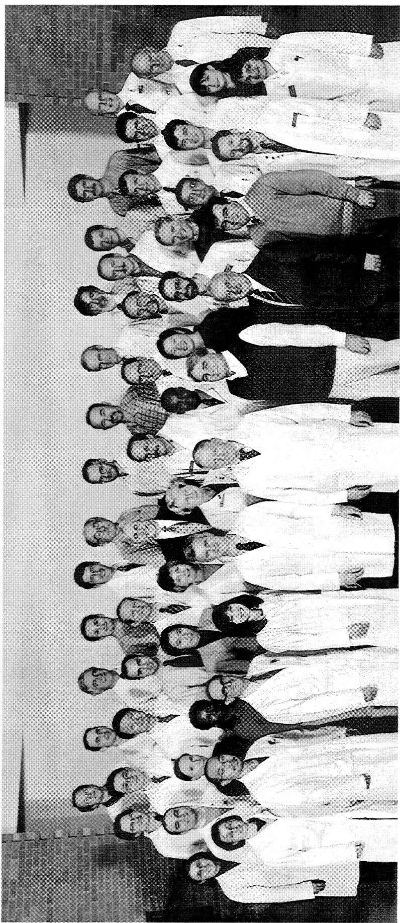
Faculty, Residents and Fellows Department of Pathology October, 1999